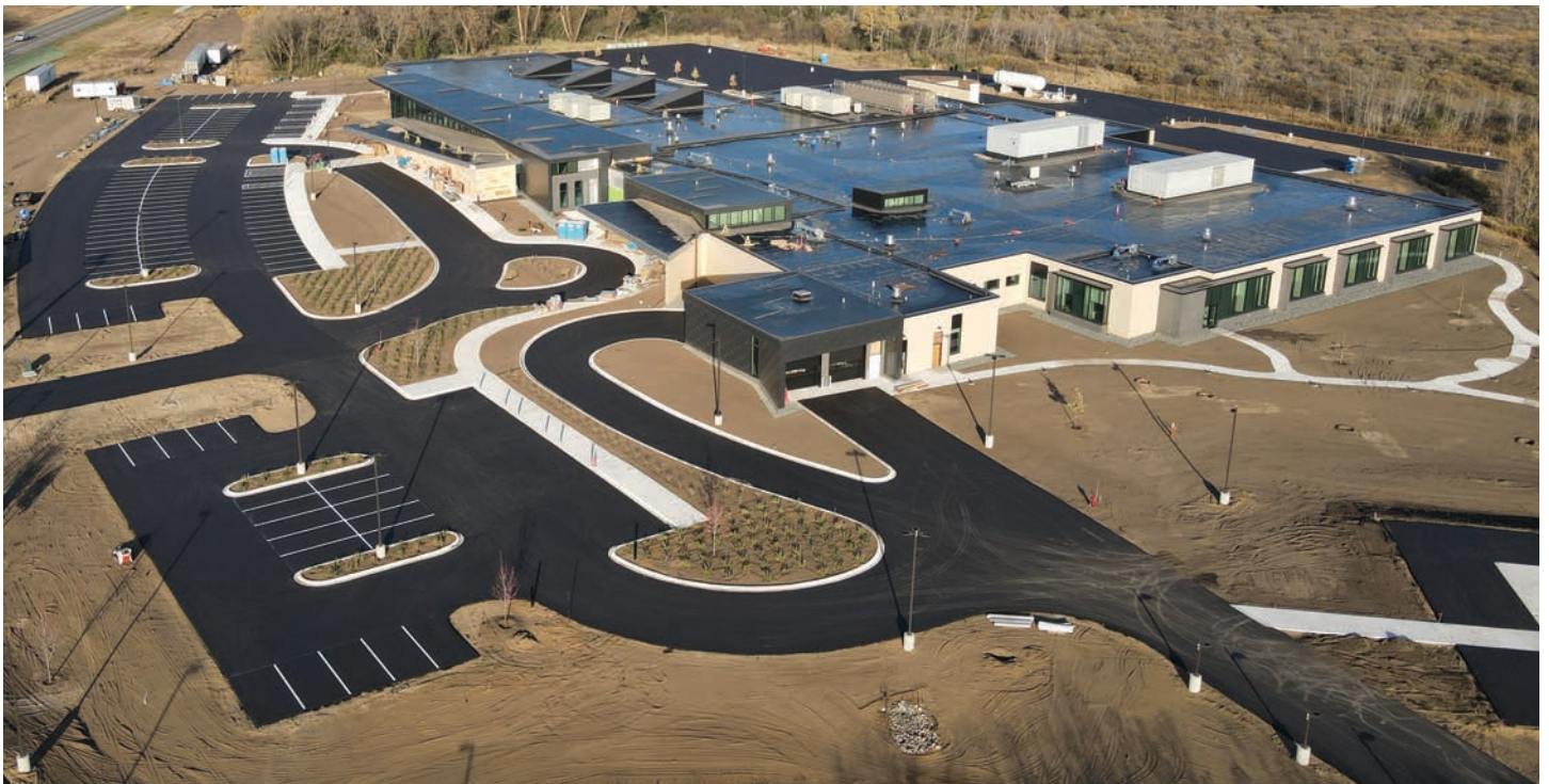
Follow our construction project at TCHC.org/Astera .